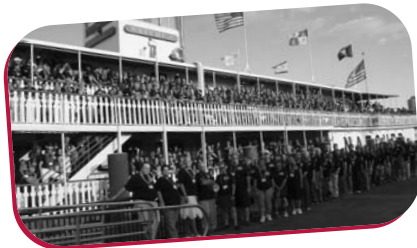
SADD National Conference attendees enjoy a special evening aboard the Steamboat Natchez, the pride of the Mississippi.