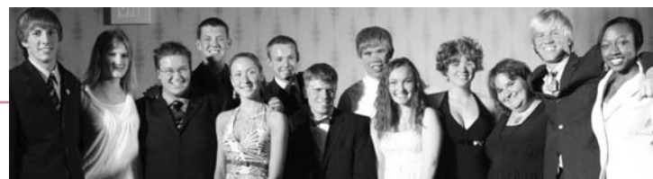
Student Leadership Council 2007-2008