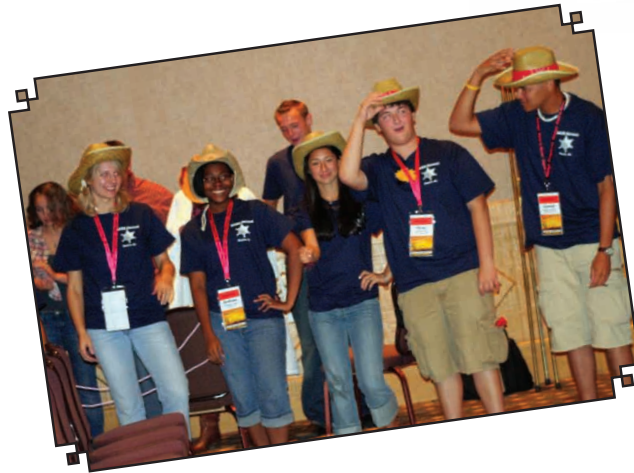
Photos from the 2008 SADD National Conference in Phoenix, Arizona